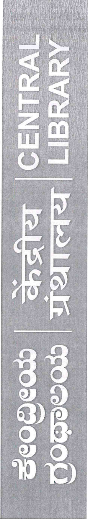
Digital Library (7.3mX1.2m)

Name of the work: Providing Tri-lingual name boards to Main Library and E-Library buildings of NITK.