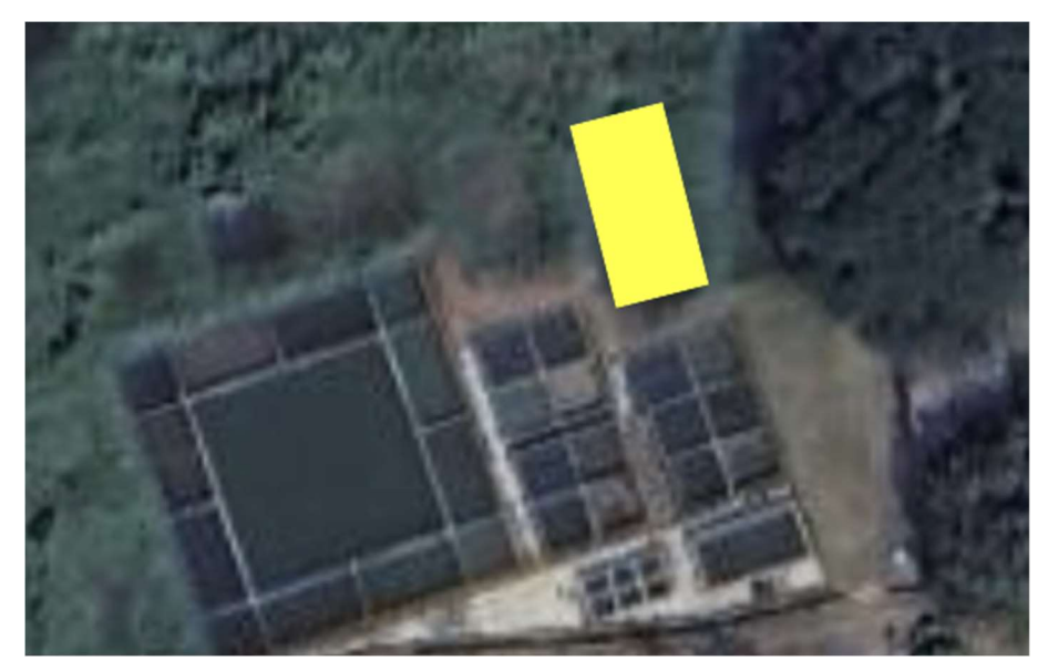
location: College of Fisheries, mangaluru

^{2 \times USB} 3.2 Gen 2, ^{2 \times USB} 2.0), Power Supply: 500W or higher. The location, depicted in the image below, measures 13ft X 48 ft and should include essential stone pitching and access for conducting experiments.